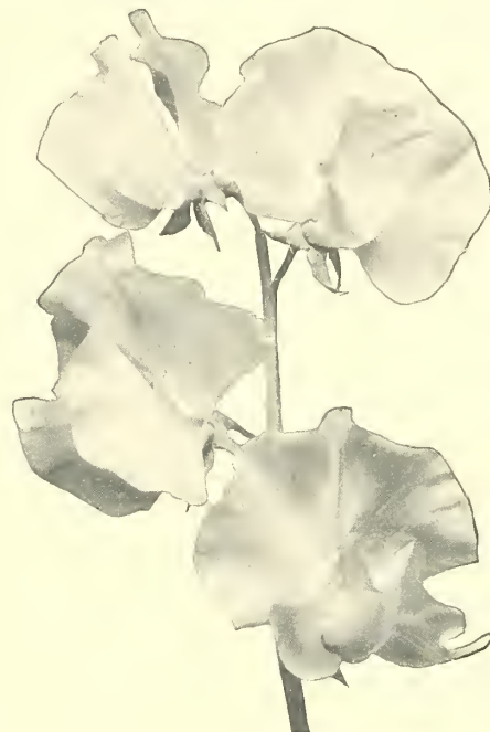
MORSE'S GIANT ROSE 1-3 Natural Size